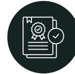
Commitment to Quality