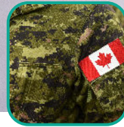
DEFENCE (NAVY & ARMY)